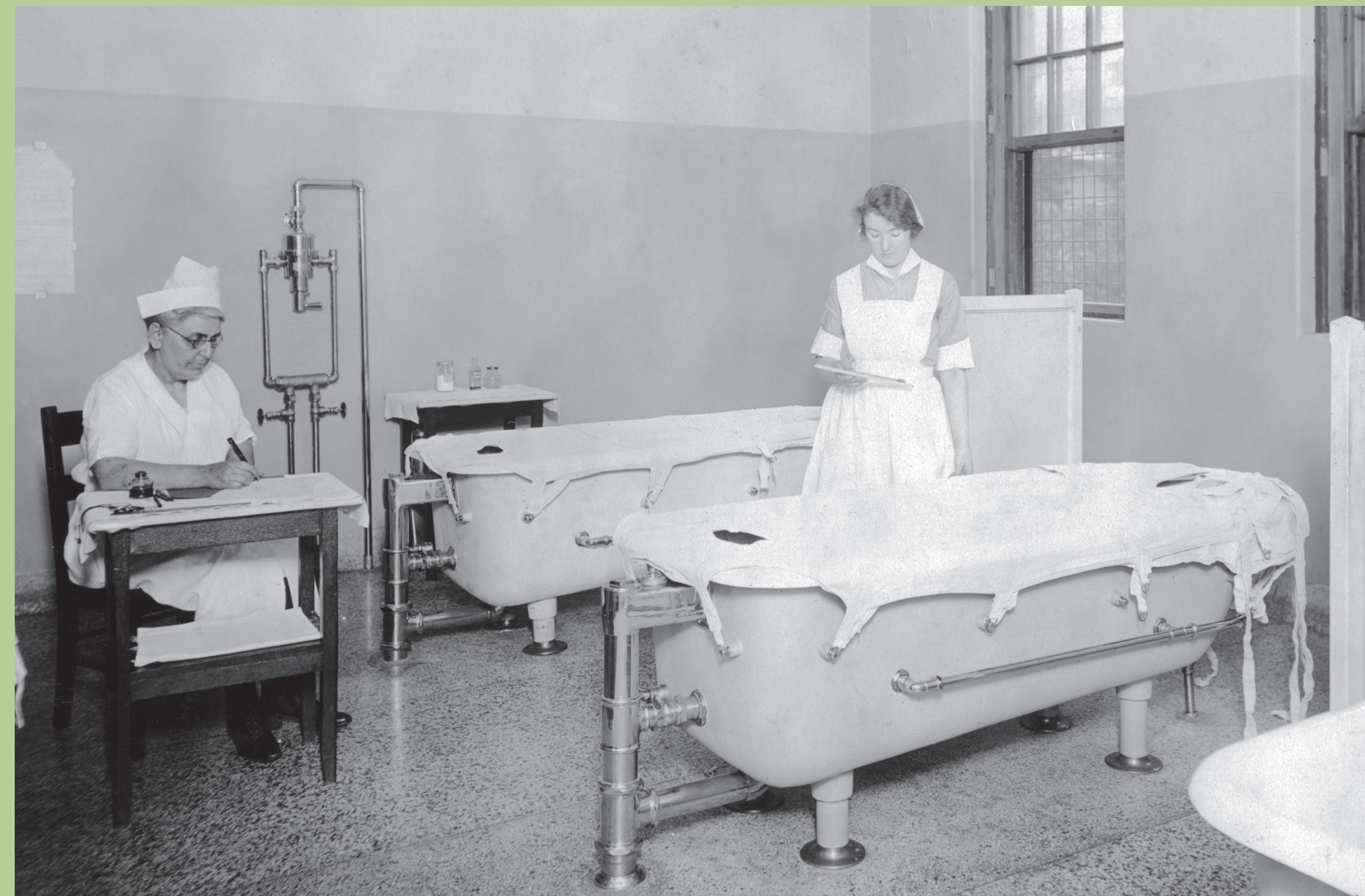
Photo: Sherer & Moore. The Life and Death of Northampton State Hospital (Historic Northampton, 1994)

SECLUSION ROOMS were used for patients who were seen as rambunctious and dangerous to secure safety for them and the people around them.