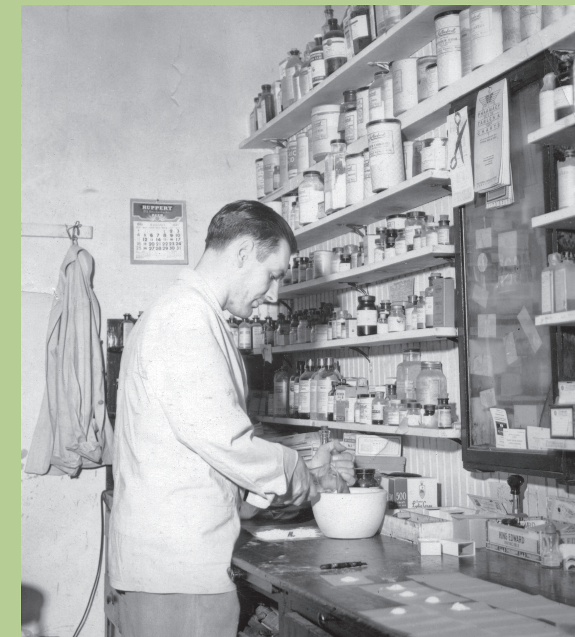
Photo: Moore & Schuleit Haber. Images of America: Northampton State Hospital (Arcadia Publishing, 2014)

After 1950, tranquilizers and antidepressants were increasingly introduced as key components of treatment. While psycho-pharmaceuticals reduced anxiety, agitation, manic episodes, and, consequently, the use of restraints and seclusion, there also were serious side effects and long-term risks to patients.